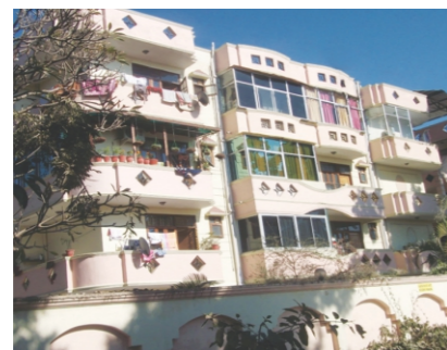
NCR Silver Rock Residency Dehradun