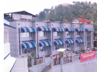
Hotel Silver Rock Mussourie