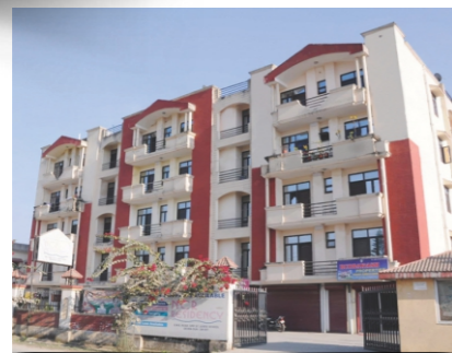
NCR Residency GMS Road Dehradun