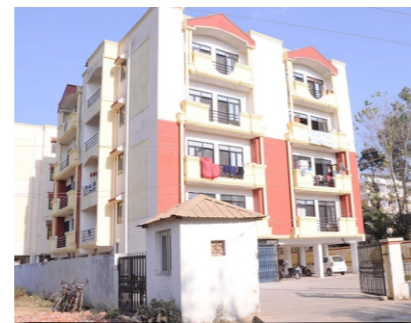
NCR Paradise Turner Road Dehradun